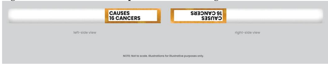
Figure 8A.2: Orientation of on-product health message